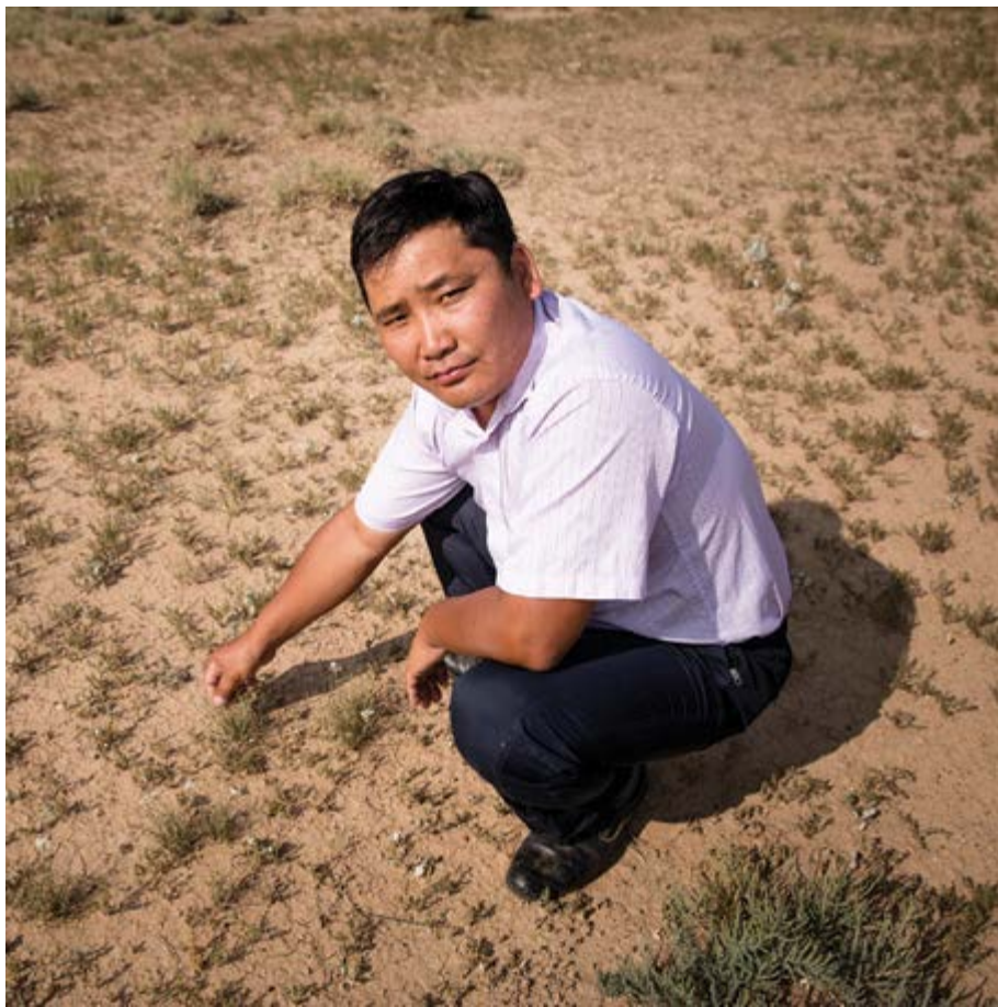
Left: Amarsanaa Byambadorj, Deputy Governor of Bayandelger Soum, Sukhbaatar Region. Opposite: The Bayanzurkhl neighborhood is one of the many ger districts that have sprung up in recent years in the hills around the edge of Mongolia's capital, Ulaanbaatar.

social change has made Mongolians less able to deal with it, and therefore more likely to migrate to Ulaanbaatar.