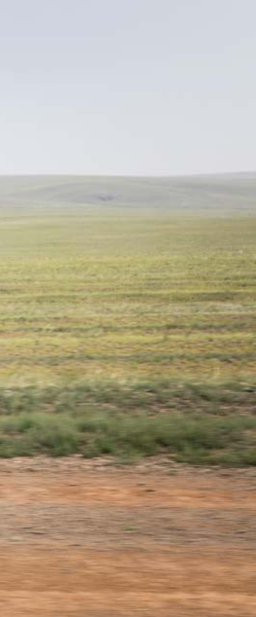
A nomadic family on a motorcycle in the Sukhbaatar Region of Eastern Mongolia, on the edge of the Gobi Desert.

away in the snow and never came back. And when we got up one morning, all the sheep had frozen to death. We had lost everything—so we decided to leave immediately for Ulaanbaatar.”