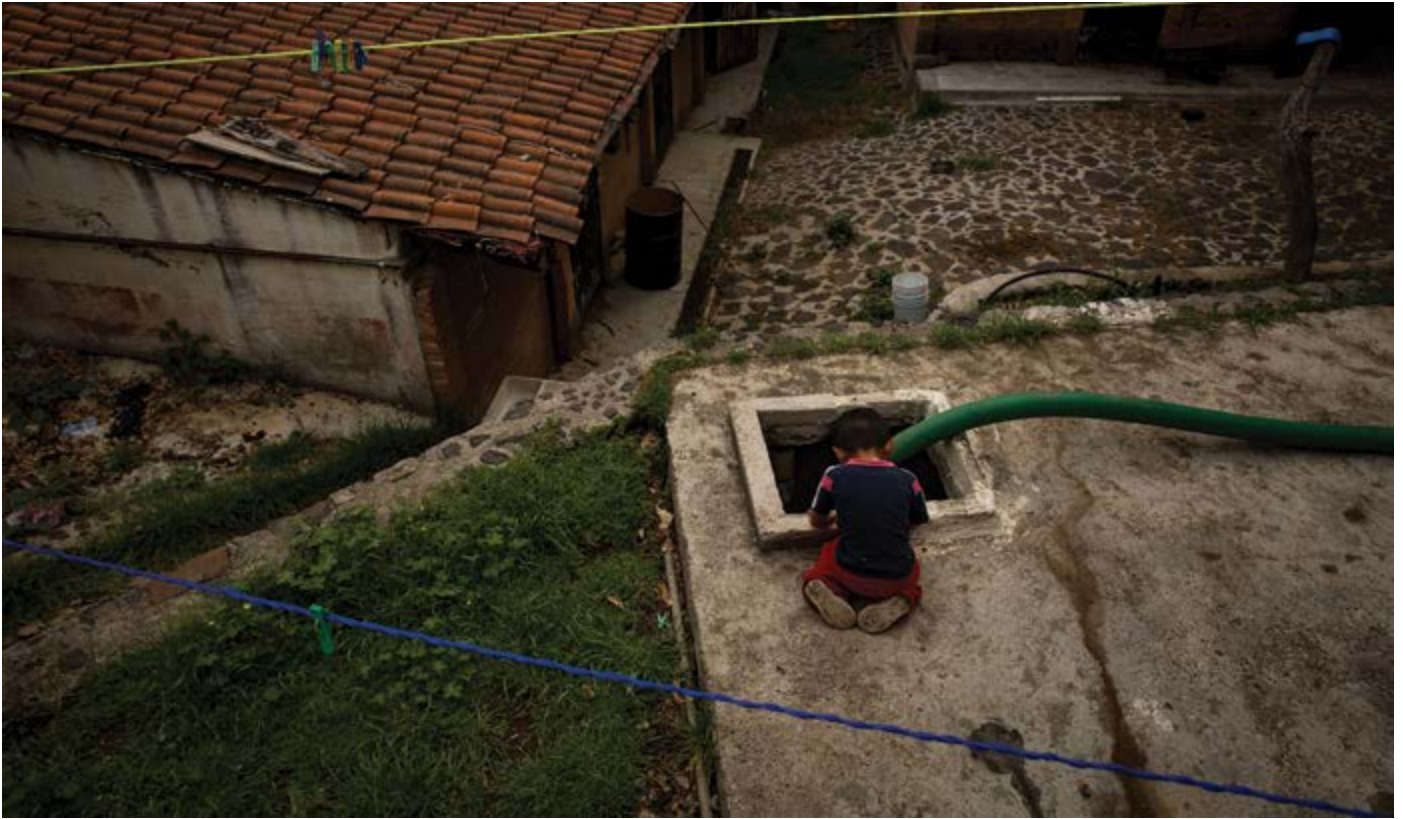
Above: Some residents rely on “pipas,” large trucks with hoses that deliver water from aquifers. Below: A pipa in the San Andrés Totoltepec neighborhood.