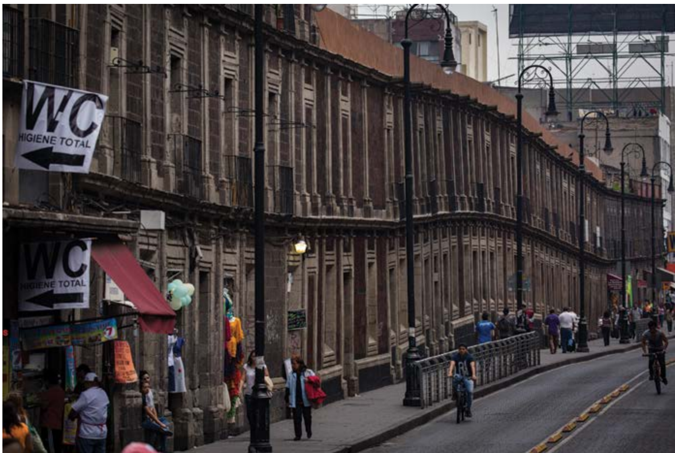
Above: Buildings now undulate where once the area was flat. Left: Volcanic soil safeguarded the water supply for centuries.