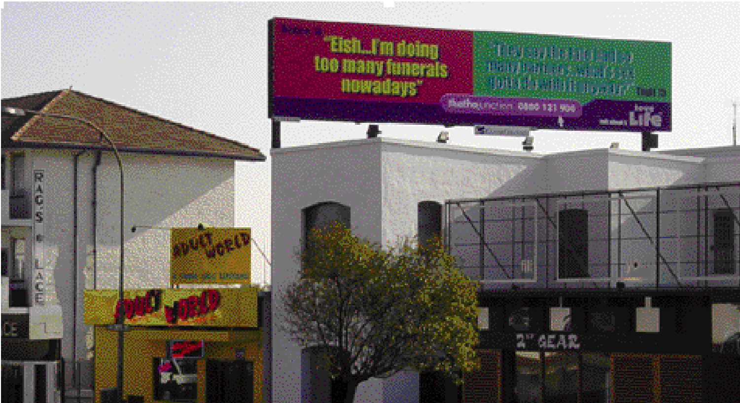
A scene supplying two very different attitudes toward sexuality in South Africa.

throughout the summit. "Population policy has become a story of timidity, failure, and ignorance," he said. The failure is to live up to the commitments of Cairo.