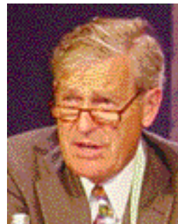
Former U.S. Senator Timothy Wirth

In fact, at an UNFPA cosponsored event, pointed criticism of the Bush administration emerged. Timothy Wirth, President of the United Nations Foundation and Better World Fund, lambasted the Bush administration for waging a profound war on women that is being orchestrated by a small group of cloistered men that do not understand healthy sexuality. The audience resoundingly responded with applause of agreement. Such disappointment with many leaders of the world's governments and non-governmental organizations was a continuing theme